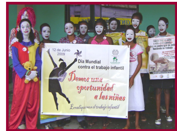
Some Dominican children bring public awareness on World Day Against Child Labour

A $200 non-refundable deposit will be required to confirm your participation. The schedule for remaining payments will be available at the first retreat.