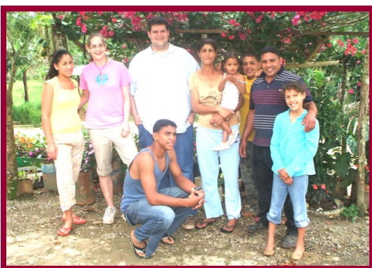
DR 2009 participants with host family