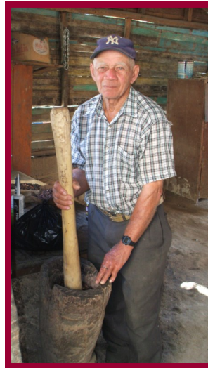
Dominican farmer grinding cocoa

Initially, the group will stay in a small community near Santo Domingo, the oldest colonial city in the Americas. We will meet with community organizations, grass roots groups and Christian base communities to see first-hand the kind of work people do in the struggle for social justice.